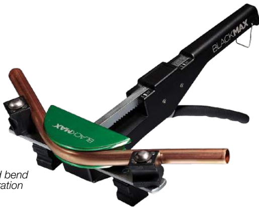
Forward bend configuration